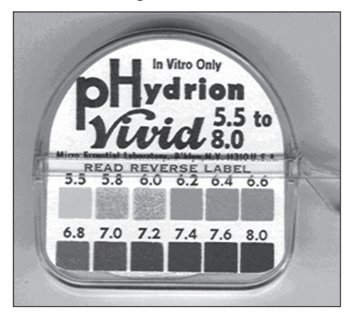
pH Paper With pH Color Chart (0.4 oz)

pH paper is a key tool to test your body's overall acid/alkaline balance by testing the pH of your first morning urine (the first urine after 5 AM). This pH roll can test a range from 5.5 to 8.0 in steps of 0.2 pH units. One roll will last for nearly two hundred tests. A convenient dispenser allows you to tear off a small strip of pH paper (1 inch or less) to dip into urine to determine its pH.